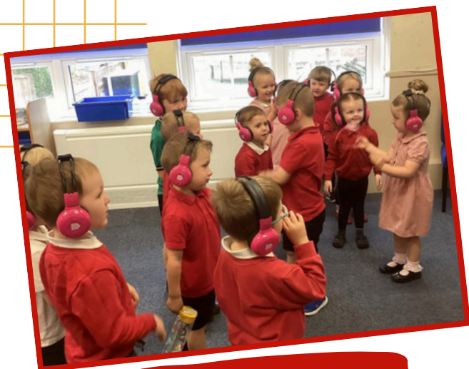
Now Press Play in EYFS

Year 5 enjoyed visiting Durham Academy this week for a PE afternoon using the sports facilities at the Academy.